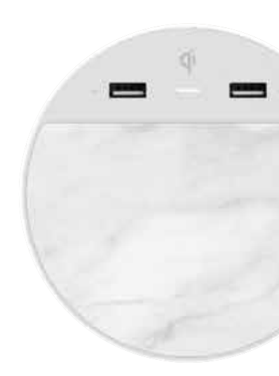
Station C with custom marble laminate

Tech products don't have to be boring black boxes. Feature your custom color palette, prints, patterns and artwork to extend your unique style onto the nightstand.